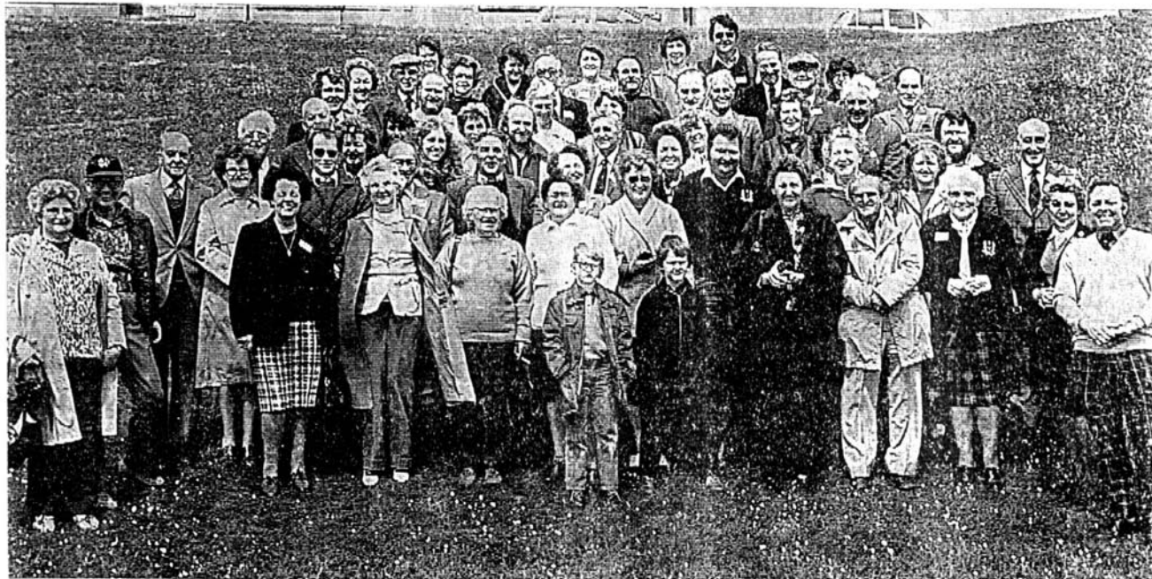
THE TURNBULL CLAN . . . Turnbells from all round the British Isles and overseas visited Hawick this weekend for the Turnbull Clan Gathering.