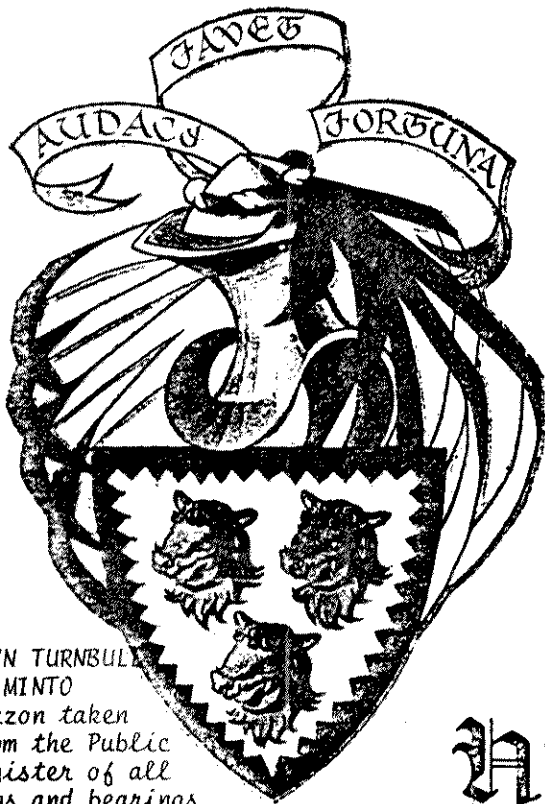
JOHN TURNBULL OF MINTO Blazon taken from the Public Register of all arms and bearings in Scotland, Vol. 1, p. 431, circa 1767