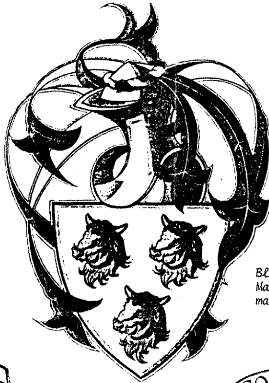
TURNBULL OF BADINRUELL (BEDRULE) Blazon taken from Pont's Manuscript, a collection of arms made by James Pont, A.D. 1624