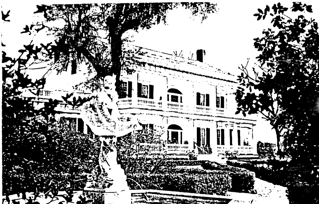
Rosedown Plantation, St. Francisville, Louisiana, antebellum home.