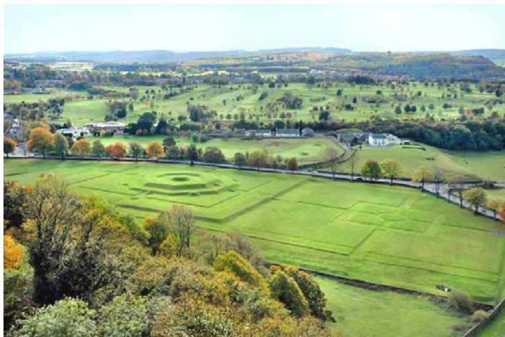
King's Park, looking down from Stirling Castle.

William Wallace and Andrew Murray lead the Scots to victory at the Battle of Stirling Bridge below the castle in September 1297. Stirling Castle was consequently surrendered by the English to the Scots. The Scots abandoned Stirling Castle after their loss at the Battle of Falkirk and Edward I again resumed control in 1298. In 1299, Robert the Bruce successfully laid siege to Stirling Castle and regained it from the English.