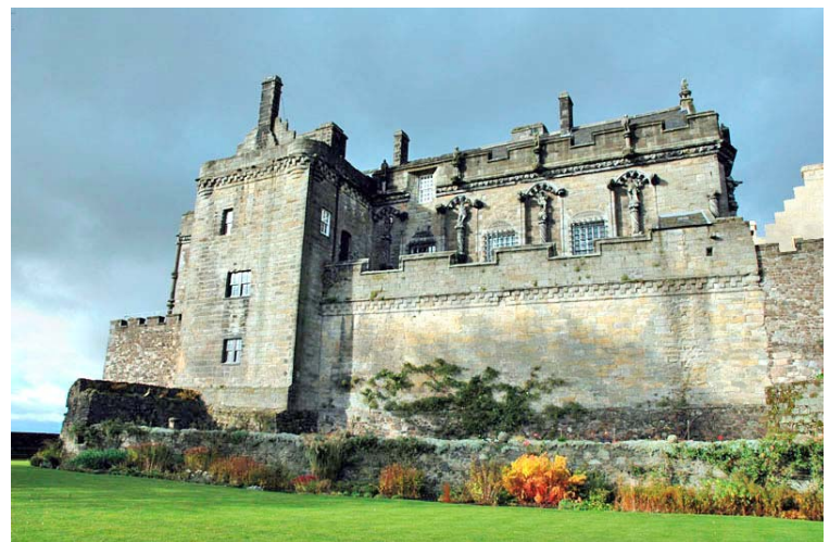
Stirling Castle proudly overlooks King's Park and Stirling Woods.

Statue of Robert the Bruce and Wallace Monument: In front of the castle is a commemorative statue of Robert the Bruce. Looking across the wall, one can see the Wallace Monument in the distance.