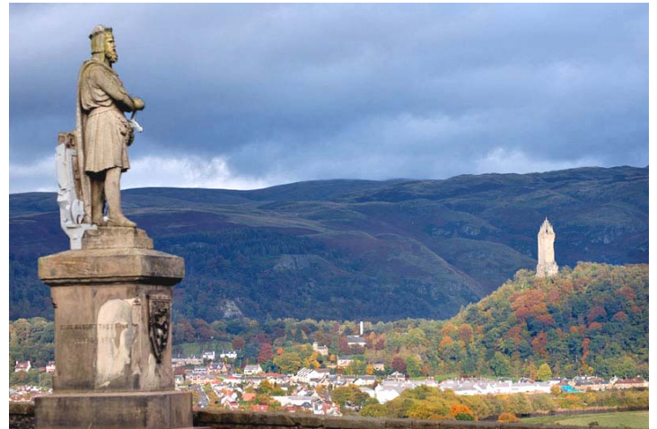
King Robert the Bruce from Stirling Castle, with the Wallace monument in the background

The Palace: In 1538, when James V was to marry Mary of Guise, he wanted something to show that Scotland could match the best he had seen in France.