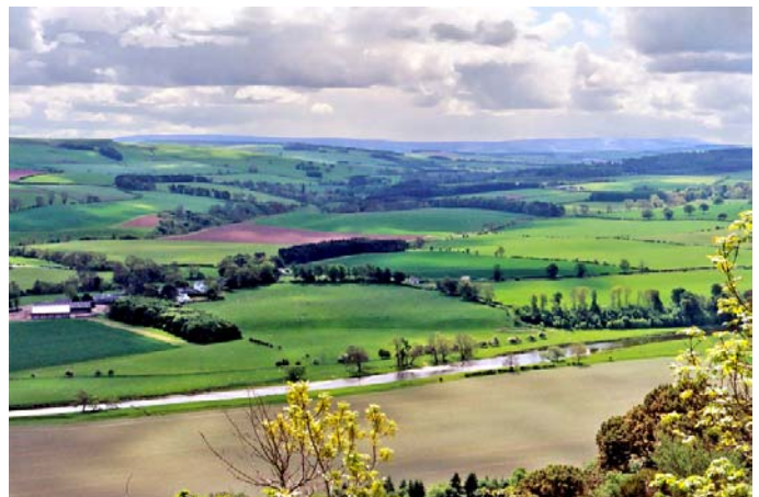
View from Fatlips south towards Bedrule.

Until it is repaired, you must not venture inside the castle and extreme caution be taken in walking around it as stones do fall from the parapet. The hilltop around the castle provides the most spectacular views to be found of the Teviot Valley, Bedrule area, and Ruberslaw.