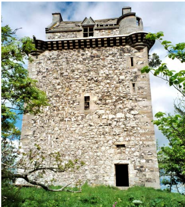
Fatlips Castle today