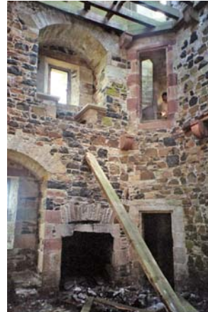
The deteriorating interior of today