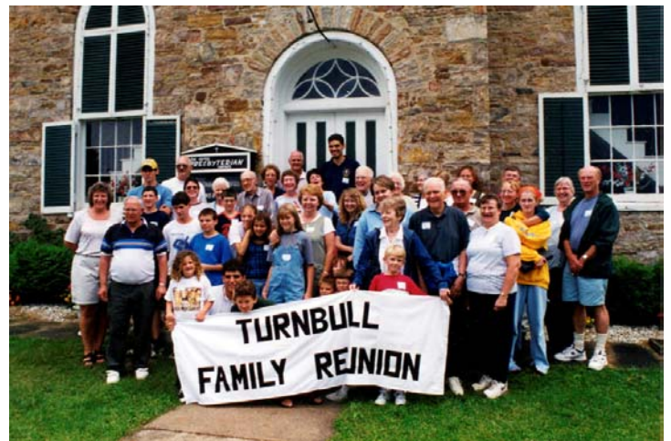
Turnbulls of Rossie reunion of 2000