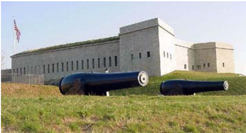
Fort Trumbull State Park, New London, CT

Fort Trumbull has existed since Revolutionary War days protecting the harbor of New London, CT. It sits on a key position in the approach to New London Harbor and the Thames River. From its position it was possible to fire upon any ship entering the Thames River. Construction for the fort was begun before the Revolution in 1775. In response to the outbreak of the revolution, the Connecticut General Assembly ordered that the fort be completed. The fort was named after the governor, Jonathan Trumbull. The only combat in Fort Trumbull's history happened on September 6th, 1781. This was a diversionary raid to distract American and French forces from Yorktown where the British army surrendered the next month.