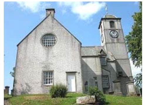
St. Mary’s Church, Hawick

St Mary’s Church was dedicated in 1214 and rebuilt in 1763. The Mote is a large mound which can be climbed to enjoy the wide view of the area from the top.