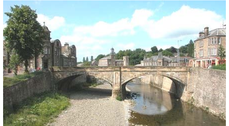
The Teviot River running through Hawick

For the past few hundred years, Hawick’s industry has centered around the textile industry. To this day, many fine textiles can be found in the area.