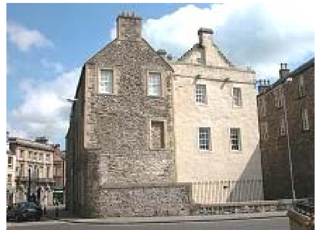
Side view of Drumlanrig's Tower

The third floor of the tower housed the garret, which was used by the household servants. Outside the garret sits a parapet walkway that runs around the head of the tower.