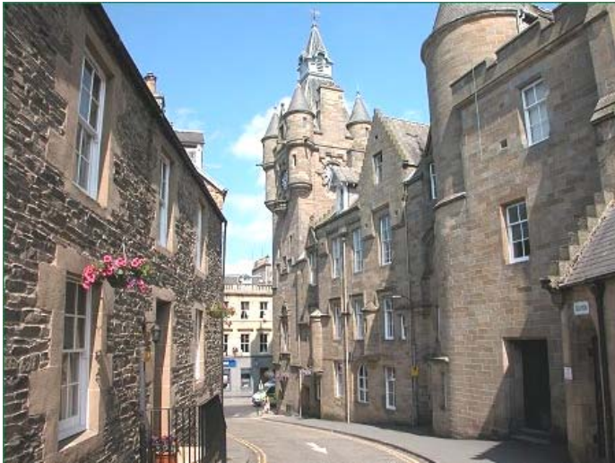
The streets of Hawick with town hall.

Interesting Facts: Hawick is the largest town in the Scottish Borders. It lies on the Teviot River. The position of the river was important to the town’s growth. Hawick was founded by the Angles in the 600’s. It was further developed by the Lovells, a Norman family, in the 1100’s.