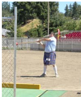
Right; Caber tossing tops the spectator sports.