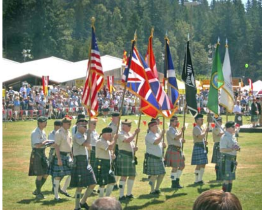
Official opening of the Pacific Northwest Highland Games begins with pole bearers.