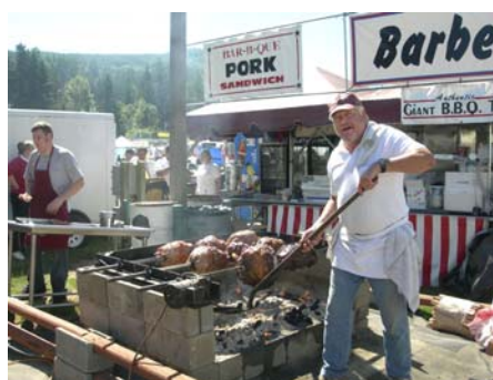
Great food is only one of the many things to enjoy at the games.

http://www.turnbullclan.com/games2005/pacific_northwest.htm