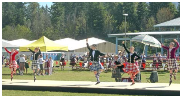
Bagpipe competition and Highland dancing add a real element of Scottish ancestry to the games.