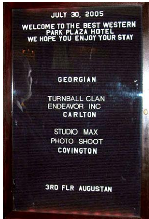
Turnbull Clan receives royal treatment at hotel.