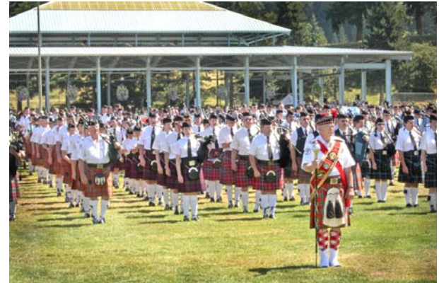
The massing of the bands brings together pipers from all over – totaling more than 300 in number, the ground shakes as they march together.