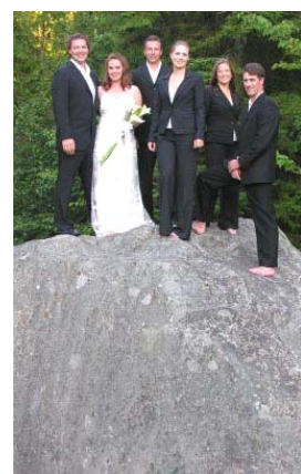
On top of the rock