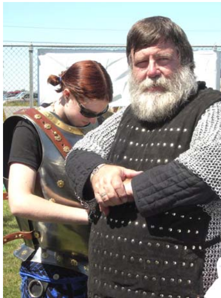
TCA members gather for the Parade of Clans during opening ceremonies.