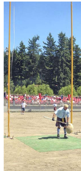
Above; Throwing a 16 lb. hammer takes great strength Left; Clansman competes in the sheaf toss.