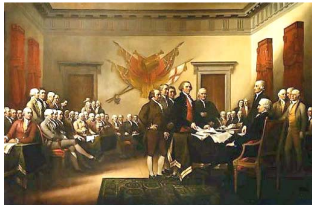
John Trumbull's painting depicting the signing of the United States Declaration of Independence.

Articles that have an historical interest but that do not relate to Turnbull history will not be included at this time. Anything interesting from Turnbull, Rule, Trumbull, Trimble, or any of the other septs of Turnbull will be included. Items already in the museum include crystal and glass objects, patents for inventions by Turnbolls, paintings, and whisky labels and other labels.