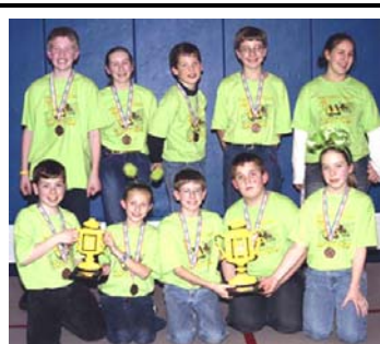
Turnbull kids participate on winning teams of the F.I.R.S.T. Robotics International competition, Atlanta, GA

The Editor would like to extend special thanks to all the TCA members who contributed to the Bullseye by sharing their Turnbull history, events and families with all of us in 2005. Submissions are always welcome to editor@turnbullclan.com