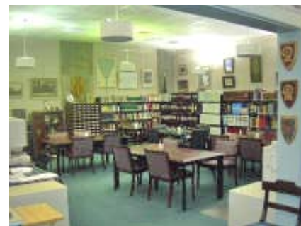
TCA history preserved in Odom Library, Moultrie, GA