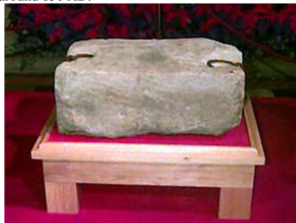
The Stone of Destiny, November 30, 1996

The unassuming piece of rock, also known as The Stone of Scone, is shrouded in myth and mystery. Weighing 152kg or 335 pounds and measuring 26 inches long, 16 inches wide, 11 inches high, it is a basic slab of red sandstone that legend says was Jacob's pillow in Biblical times. The story goes on; stating the stone was brought to Scotland by way of Egypt, Sicily, Spain and Ireland before arriving in Scotland somewhere around 850 AD. Supporting this idea is the history of the ancient Irish Kingdom of Dalriada which existed from around 400 AD until around 850 AD.