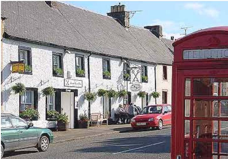
The Cross Keys Inn on the main street around the Village Green.

Historical significance to Turnbills: Turnbills originally owned the majority of land in and around Denholm. In the late 1700's to the early 1800's John Turnbull still owned much of Denholm.