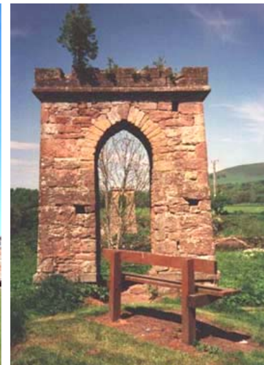
Tower remaining from the original chain suspension footbridge.

Today Denholm is the home of several annual festivals, including music festivals, flower festivals and the Jimmie Guthrie Memorial Run for Vintage Cars and Motorcycles.