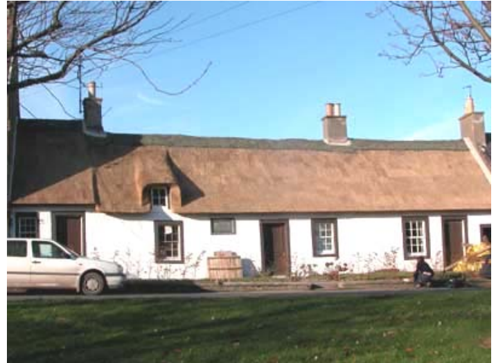
John Leyden's home still stands near the Village Green.

John Leyden's home where he was born in 1775 still stands and can be seen to one side of the Green. It is typical of the types of cottages built in the 18 th century.