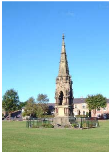
Leyden Monument on the Village Green

Around 1826 a chain suspension footbridge was erected between Denholm Mill and where the later built Teviot Bridge stands. The stone towers which supported the bridge can still be seen.