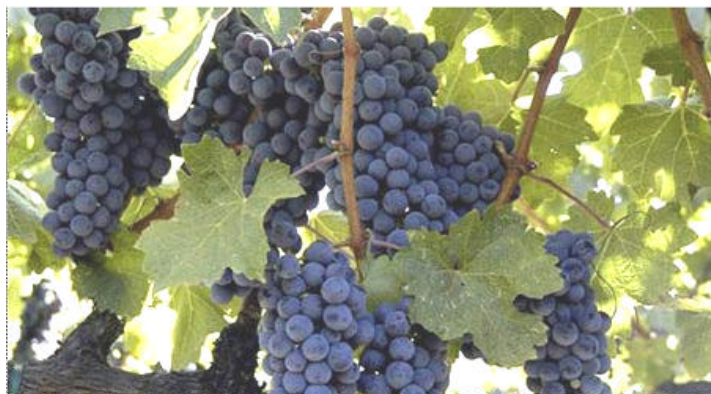
Harvest season is September to October. Check with the winery for the best time to come if interested in seeing grapes on the vines.

The address of the winery is 8210 St. Helena Highway (Highway 29). Tours are available by appointment. The Tasting and Retail Room is open seven days a week from 10:00 a.m. to 4:30 p.m. If you visit you'll see a table in the tasting room dedicated to Turnbull Clan Association with copies of the Bullseyes and other things Turnbull. If you visit, be sure to tell them you are a Turnbull. You will receive special treatment!