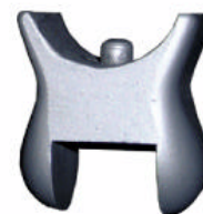
This small xipper (actual size shown) solves a big sized problem.

We all know how frustrating it is to try to open that new CD we are dying to listen to or watch the new DVD and not be able to open to the package. Well, thanks to Bonnie Turnbull there is a simple solution to the problem! Her invention, called the xipper handles the problem easily.