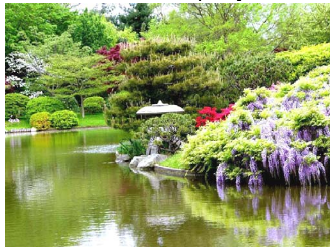
The Missouri Botanical Gardens are beautiful year round.

have added a kid's garden this year, quite impressive and fun! Tickets are reasonable, parking is free.