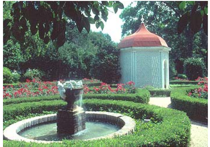
View of the Rosedown gardens

The music room contains a Chickering piano and chair bought by the Turnbolls in 1841. As pianos stay in tune best when played, an invitation is extended for someone to play it. From there, one goes to the large bedroom on the north end of the house. An interesting feature there is the water closet, or some say a shower, which is said to be one of the earliest known.