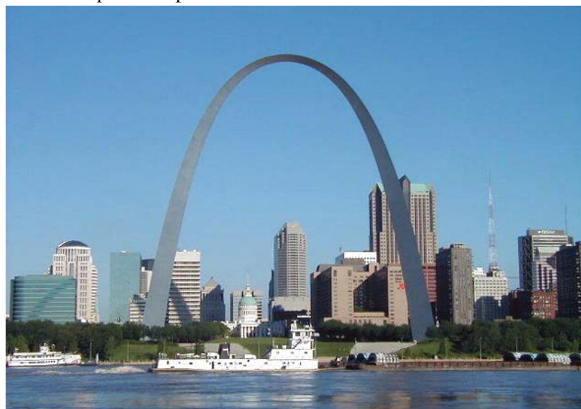
The arch, now 40 years old, opened in 1965 to honor President Thomas Jefferson and his vision of a continental United States.

One must start with the Gateway Arch ( www.gatewayarch.com ) and the Westward Expansion Museum, located underground, under the Arch. One can see over 30 miles from the top, on a clear day. The tram ride up is an experience in and of itself!