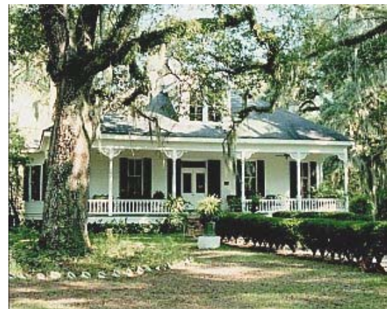
Catalpa, Parish of W. Feliciana