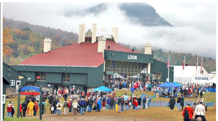
Bad weather doesn't stop crowds from returning to Loon Mountain for the annual Highland Games.

accompanied by a Piper, it is truly an experience you'll never forget.