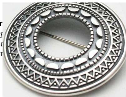
Celtic jewelry offerings include this handmade brooch, whose design is based upon the symbol for the sun.

Best of Borders supports the work of the Borders Forest Trust (BFT). BFT is an environmental charity established in 1996 to develop and manage ambitious habitat restoration and community woodland projects and to reverse the decline of woodlands and wild places in the Scottish Borders.