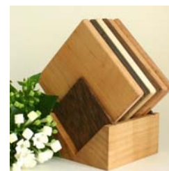
This wooden coaster set is one of many examples of products supporting the Borders Forest Trust.

Over the years the Trust has acted as a platform to bring together groups and individuals interested in the conservation and expansion of native woodlands to work collectively towards fulfilling the vision of the restoration of native woodland heritage to the South of Scotland. Their vision is for the South of Scotland to be a place where a rich network of native woodlands and wild places flourish, cared for by local communities.