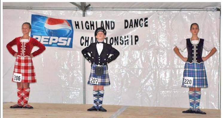
Dance competitions were among the many events entertaining visitors.