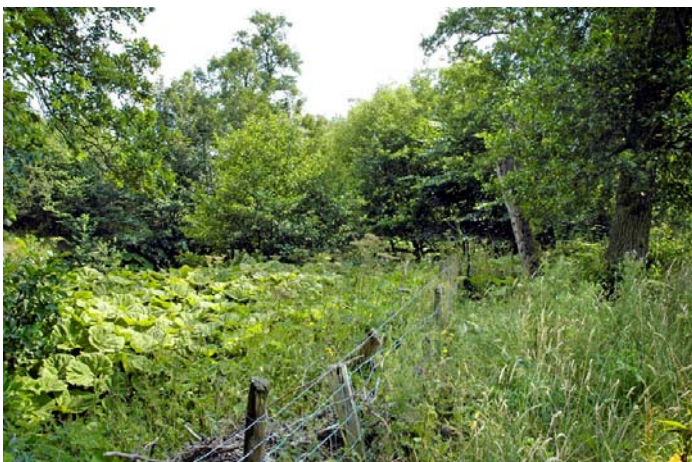
The Barony of Bedrule borders the Rule River and the site of Fast Castle, an early Turnbull stronghold.

Feudal earls and barons retained the right to hold baronial courts and some residual rights of jurisdiction until the final abolition of the feudal system in 2004. Although rights of public jurisdiction were then abolished, it appears that barons can still hold private courts if they so wish.