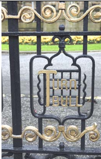
Main Gate, Glasgow University

We leave the little town of Melrose and depart for a day at Glasgow University , founded by Bishop William Turnbull. Our day will include highlights of Turnbull tributes at the University, a chapel service provided just for us and a special lunch in the Turnbull room .