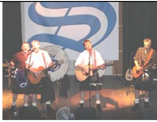
Left and above, the popular band Scocha