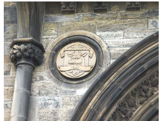
Original crest of Bishop Turnbull at Glasgow University

In the afternoon, we'll continue our journey back to Edinburgh and check into the Apex International Hotel once again. (Supper is on your own, perhaps at one of the great little restaurants or pubs next to the hotel.)