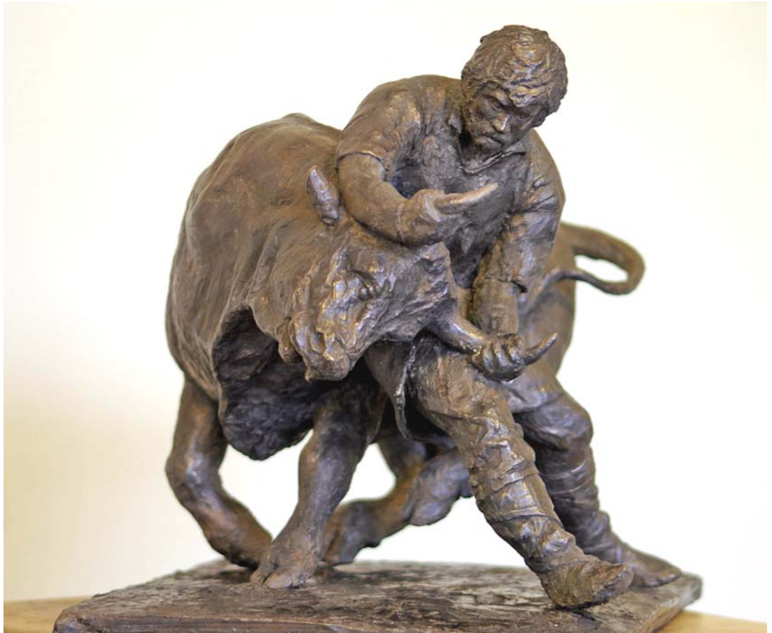
This limited edition fine art bronze sculpture of the Turning of the Bull monument approximately 9" high by 12" wide will be given to major contributors.