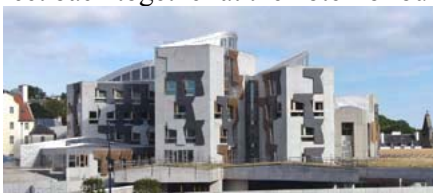
Scottish Parliament, Royal Mile, Edinburgh

After another Scottish breakfast at the hotel, we'll begin our day with a Edinburgh bus tour of the city . After this tour, we're on our own to visit the sites, including shopping on the Royal Mile , parliament, and Edinburgh Castle . (Lunch is on your own.) We'll meet back together at the hotel for our Farewell Dinner .