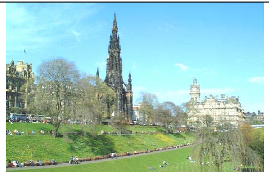
The Scott Monument, Edinburgh