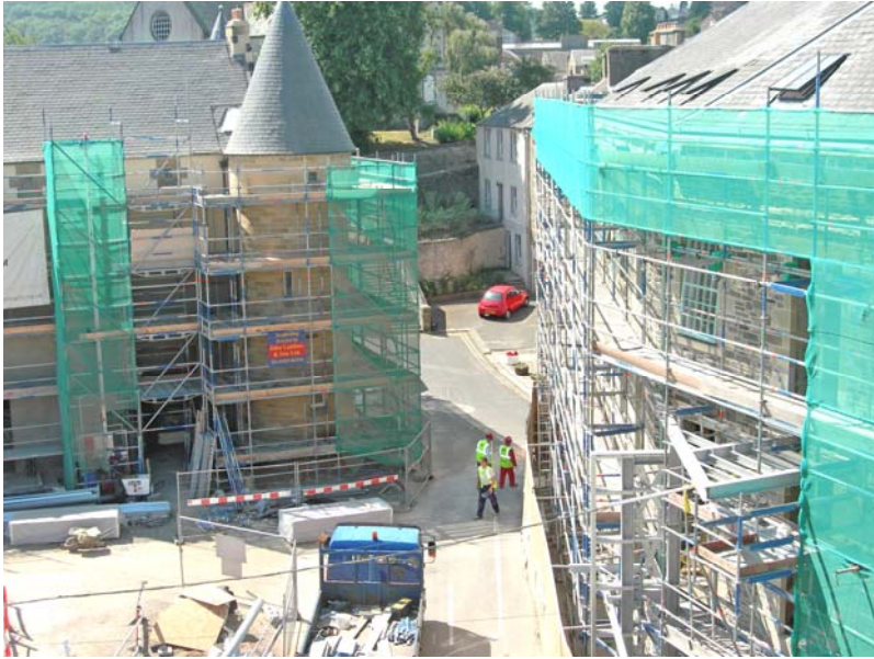
Ongoing construction of the Heritage Hub. The hub is scheduled to open in the Spring of 2007.

The Turnbull Turning of the Bull Monument has found a home in the newly constructed and prestigious Hawick Heritage Hub! The Hawick Heritage Hub is part of a massive and ongoing Heart of Hawick project.