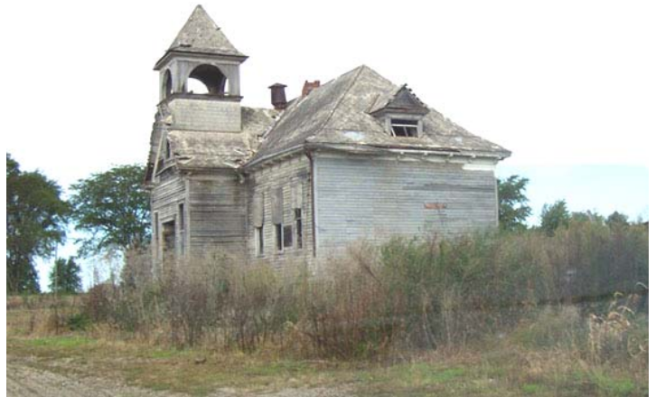
Elmira schoolhouse – photo taken September, 2006

What happened to Elmira is a familiar story of the small town bypassed by railroads and progress... Elmira and its