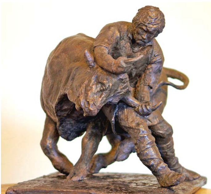
The prominent position of the Turning of the Bull monument in the courtyard of the Hawick Heritage Hub will bring our clan history alive to countless visitors.

The town of Hawick and the Heritage Hub will be the perfect home for the Turning of the Bull monument. The Turnbull history is coming alive in the Borders again. TCA directors are very excited about this agreement of placing the monument in such a historical place relevant to all Turnbulls worldwide.