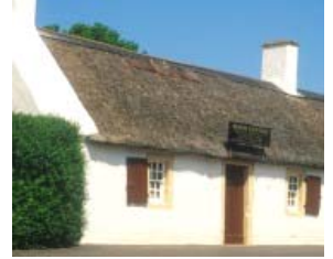
Robert Burns birthplace, Alloway, Scotland

The Clan Gathering will be culminated with a showcase Parade of Clans. Clan members will walk the Royal Mile together ending at Edinburgh Castle.