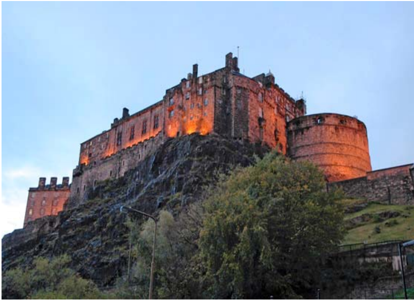
Edinburgh Castle on a summer's eve

2009 marks the 250th anniversary of Scotland's national poet and international cultural icon Robert Burns whose message of friendship in his imaginative and emotional poetry lives from generation to generation. His poem Auld Lang Syne set to music heralds in the New Year for English speaking people everywhere. To celebrate this occasion, the Scottish government is organizing a year full of events and is calling 2009 the "Homecoming Year."