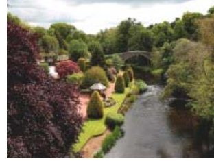
Birg-O-Doon, Ayrshire, an inspiration to Burns poetry

The largest single event being planned is the Clan Gathering, July 25 and 26, Edinburgh. The object of the two day event is to stage an international Clan Gathering and Highland Games to celebrate Scotland's rich history and cultural traditions and to hold the largest Clan Gathering in history. The Scottish government is using this event as an opportunity to thank Scottish societies from around the world for their role in keeping Scottish traditions alive.