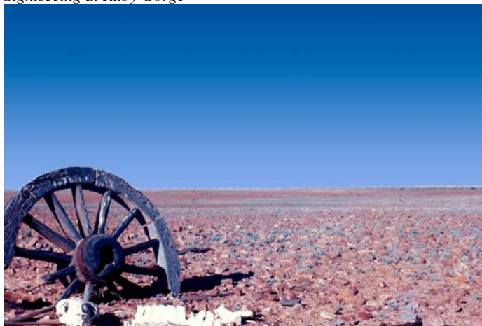
The Gibber desert near Birdsville