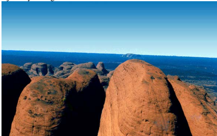
Ayers Rock from the Olgas