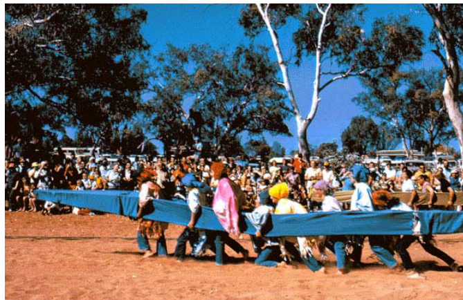
Dry river racing – Annual Henley on Todd Races

Central Australia, also known as the ‘Red Centre’, is a part of Australia's Outback as is the Northern Territory and parts of Western Australia, Queensland and South Australia. These images I have recorded and captured in the Outback, illustrate some of the spectacular areas this ancient land has to offer.