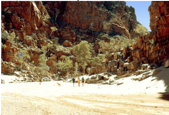
Sightseeing at Ruby Gorge

The inland of Australia is known as ‘The Outback’ and is roughly the size of seven United Kingdoms. It hosts a little over one million inhabitants or 5 % of the total population. Within this vast area, there are three major deserts, all of which have a reputation of being extremely harsh and challenging environments. With very little rain in these areas, the Outback has only two seasons; the ‘Hot’ and the