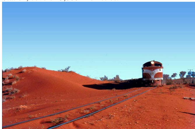
The Ghan in the Simpson Desert

‘Dry’. Temperature extremes vary from below freezing at night to 45+°c (112° f) during the day. Pastoralists, who live in these areas, run either cattle or sheep on these large properties, known as Stations. One of these, Wave Hill Station, covers 13,000 kilometres.