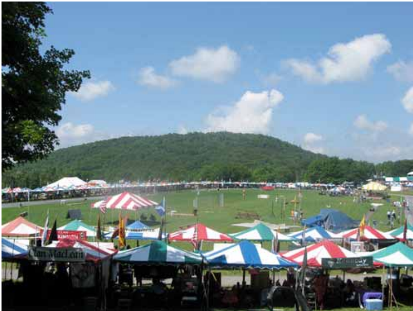
The 53 rd Annual Grandfather Mountain Highland Games was an ideal setting for the Turnbull Clan Association Annual General Meeting.

Surrounded by mountains and picture perfect weather, the Grandfather Mountain Highland Games offered a perfect setting for this year's TCA Annual General Meeting (AGM).