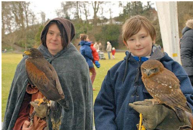
Enactment scene from the 2008 Hawick Reiver's Festival.

From 27th to 29th March 2009, Hawick steps back in time to the 16th century and through drama, song, poetry and reenactments invites visitors and towns-people alike to experience life in this turbulent, often violent, but very colourful period in our history. A full programme of activities is planned many of which are free to the public and include demonstrations of falconry, archery and horsemanship, a look at craftsmen of the times and dramatic re-enactments. There are also concerts, guided walks, historical lectures and many other activities.