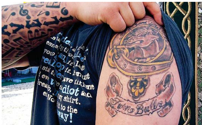
Cory Turnbull proudly displays his tattoo of the Turnbull Crest.