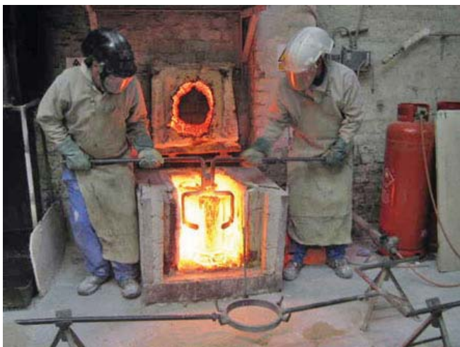
Above: A crucible in the furnace.

It's countdown time. The long awaited unveiling of the Turning of the Bull Monument in Hawick, Scotland is just a few weeks away! July 18, 2009 the Turning of the Bull will be officially unveiled at the Hawick Heritage Hub. The