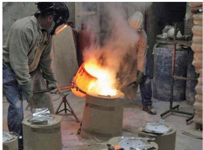
Right: Pouring bronze in a section of the monument.