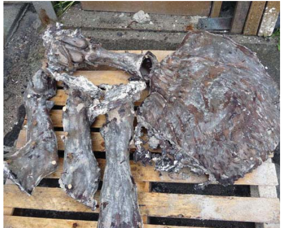
Above: Cast sections before metal work.