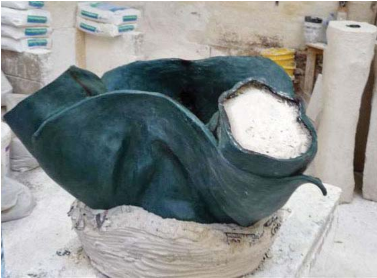
Above: The tabard and thighs, upside down.