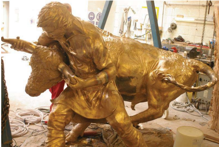
The Turning of the Bull monument is almost finished. Above, the welding joints and numerous pieces of the monument will become one and ready for installation when the patina is applied.

On delivery day, the statue will be loaded by crane onto a very large lorry and transported to the Hawick Heritage Hub where another crane will be waiting to unload it and place it onto the prepared plinth. The plinth is a base that is covered in granite on which the Turning of the Bull will be mounted