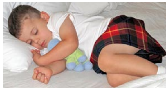
Camden Turnbull has the right idea. A perfect ending to a perfect day...