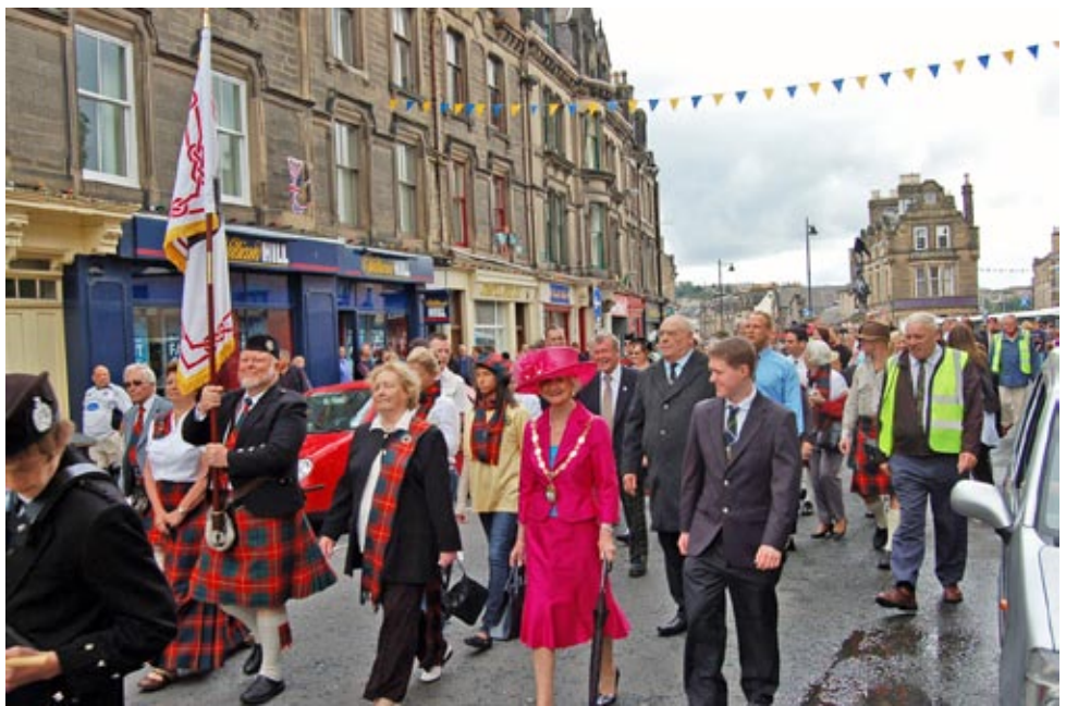
The Turnbull Clan Association Arms fly above town hall announcing that Turnbolls are in town!