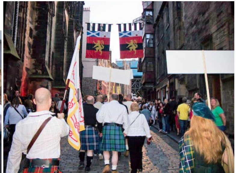
Below: A performance on the Esplanade of the Castle, titled Aisling's Children , finished off the evening. It portrayed a symbolic journey of 6 generations of Scots in and out of Scotland.