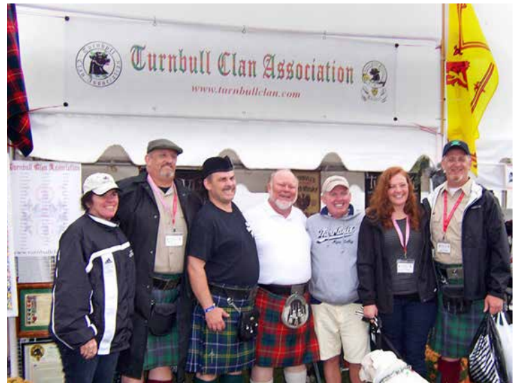
Turnbulls and Trimbles gather for the 2013 Central Virginia Celtic Festival and Highland Games in Richmond, VA. The 2015 AGM will be held here in October.

The AGMs always provide a wonderful opportunity to celebrate our Scottish heritage, meet extended family, and just plain have fun! Mark your calendars and plan to join us in October. We'll have a Turnbull Clan gathering on Saturday night, the 24th, at a local restaurant. Stay tuned for more details. For more information about area hotels and things to do, visit http://vacelticfestival.com .