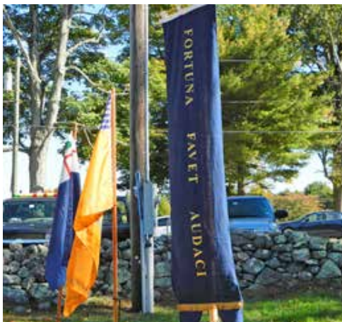
Left: Pictured is a reproduction that I painted of the pennant that flew aboard the audacious Connecticut Privateer, "Governor Trumbull" during the American Revolution. The pennant bore the Trumbull family motto, "Fortuna Favet Audaci" (fortune favors the bold).