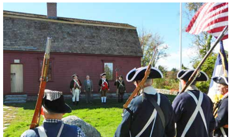
War Office (owned and maintained by the CTSSAR). (Red building)