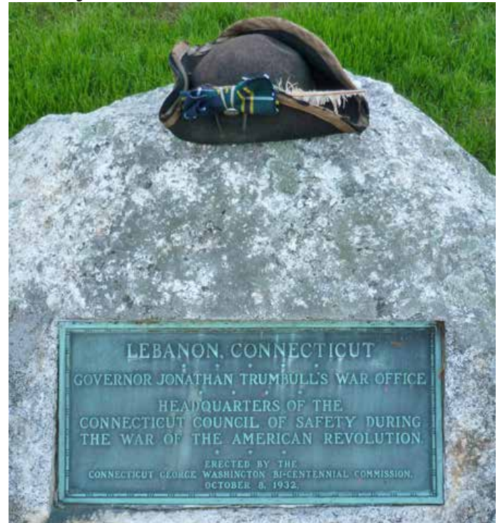
War Office Monument: My tricorn hat is shown with the cockade being a wee bit of Turnbull tartan in honor of Governor Trumbull's Birthday, and my Trumble/Trumble/Turnbull family ancestry.

Right: Members of the Connecticut Line, Living History/Color Guard Unit of the Connecticut Sons of the American Revolution line up in front of the War Office. The War Office was the center of Connecticut's Revolutionary War effort, and it was here that Governor Jonathan Trumbull, Sr. met with the Connecticut Council of Safety during the American Revolution (1775-1783)