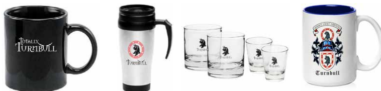
These and many other items, including Turnbull Tartan garments, available at totallyturnbull.com . Support the Clan and give the perfect gift.

TotallyTurnbull.com exists as your one stop shopping site for personal items and family gifts. From Turnbull Tartan items made by the world famous Lochcarron Mills in the Borders to specialty gift items, this is the perfect place to find that perfect gift. A closeout sale is going on now to make room for new items. Once some of these items are gone, they won't be available again. A portion of the proceeds will go to help fund the Turnbull Clan Tent Host Fund. Support the clan and don't miss out on soon to be discontinued items. Any orders for $20 or more placed before Dec. 15 will receive a free Turnbull Shopping Bag.