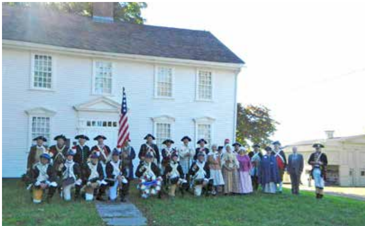
Above: Members of the Connecticut Line, Living History/Color Guard Unit of the Connecticut Sons of the American Revolution line up in front of the Gov. Jonathan Trumbull, Sr. House (owned and maintained by the CT DAR). (White building)

On Saturday, October 10, 2015, the Connecticut Society of the Sons of the American Revolution and the Connecticut Daughters of the American Revolution commemorated the 305th Birthday of Connecticut's Revolutionary War Governor, Jonathan Trumbull, Sr. (1710-1785). The annual event took place at the Gov. Jonathan Trumbull, Sr. House/Wadsworth Stable in Lebanon, Connecticut. The event included a Revolutionary War flag presentation, 18th century artillery and cavalry demonstrations, and ceremonies for Gov. Trumbull's Birthday, and the 125th Anniversary of the Daughters of the American Revolution.