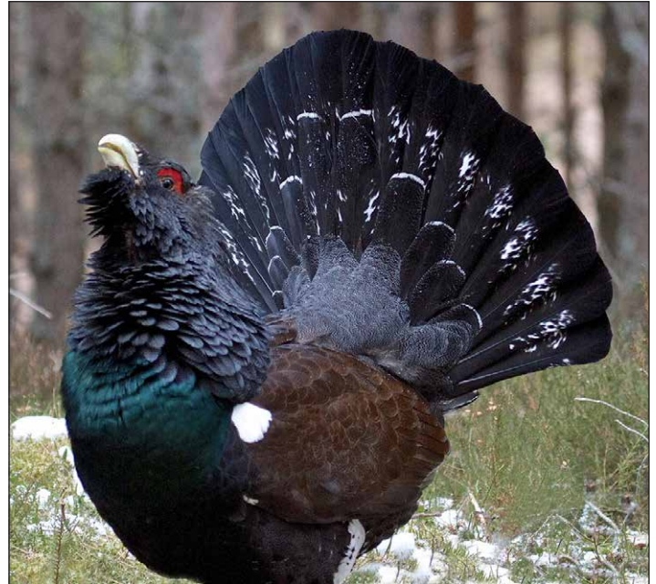
The male of the species showing off its plumage display

Male capercaillie are predominantly black and grey in colour and have reddish-brown wings with a white patch on the shoulder. The head, neck and breast are tinged with blue,