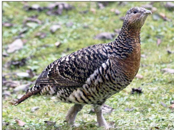
The much smaller female of the species

They are now protected under the Wildlife and Countryside Act, implemented in 1981, which in short, the act gives protection to native species, especially those at threat. In part, it aims to protect all European wild birds and the habitats of listed species including the capercaillie.