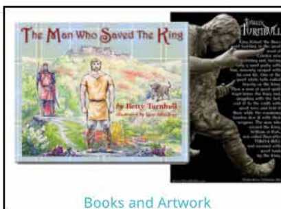
Books and Artwork