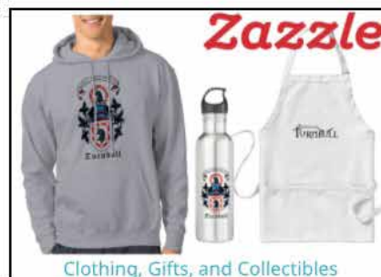
Clothing, Gifts, and Collectibles

Proceeds go to help Turnbull Clan Association projects. Please bookmark this page and check back often as new items are added on a regular basis plus Like our Facebook page for regular updates.