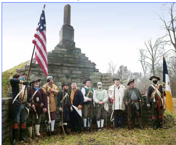
Members of the Connecticut Line, Living History/Color Guard Unit of the Connecticut Society of the Sons of the American Revolution and Ye Olde Lebanon Towne Militia, place a wreath at the Trumbull Family Tomb, Trumbull Cemetery, Lebanon, Connecticut.

His fourth son, Colonel John Trumbull, the Artist of the American Revolution, is buried elsewhere. We flew the thirteen star flag, referred to as the "Trumbull flag," in his honor.