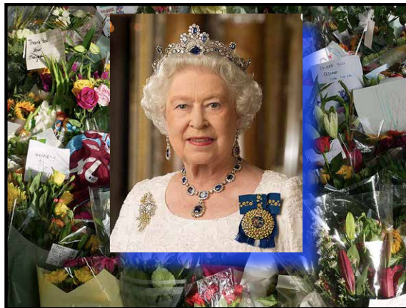
THE END OF AN ERA

Then in 1947, while the world was recovering from the war, she married her sweetheart, Prince Philip Mountbatten, former Prince of Greece and Denmark. He was bestowed as Prince Philip, the Duke of Edinburgh.