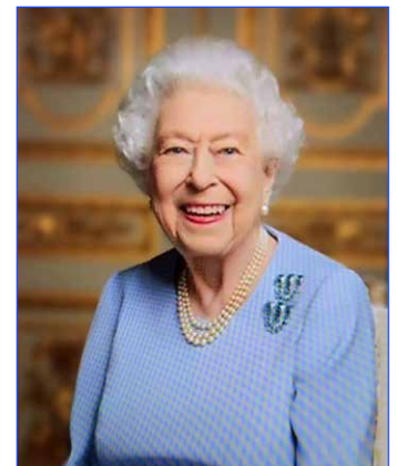
Queen Elizabeth's last portrait at the age of 96

In 1999, the newly devolved Scottish Parliament in Edinburgh was attended by the Queen. Lord Steel the presiding Officer commented, "It is good that today, once again, we the elected representatives of the people are able to welcome your majesty, not only as Queen of the United Kingdom, but seated as you are among us, to greet you in the historic and constitutionally correct manner, with warmth and affection, as Queen of Scots." Of interest, the Scottish National Party President wrote to the Queen asking her to adopt the title 'Elizabeth I' in Scotland.