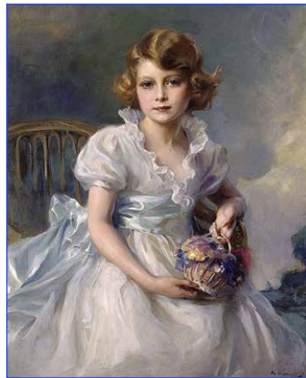
Princess Elizabeth's portrait at the age of 7

The young princess spent much of her childhood at Glamis Castle in Scotland, her father's ancestral home. Her younger sister Margaret, was the first Royal child to be born in Scotland since 1600.