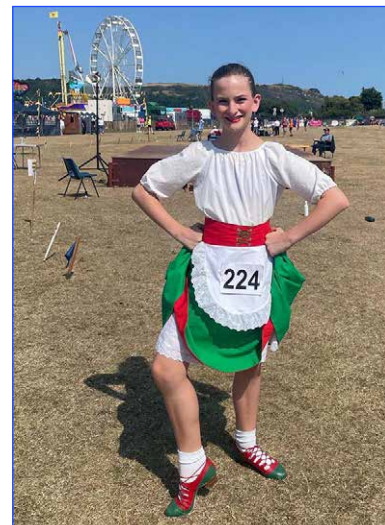
At the Burntisland Games in Scotland

The customary famous anthem by Robert Burns, Auld Lang Syne , is played at the end of each performance, with a march by the Pipers down the Royal Mile.