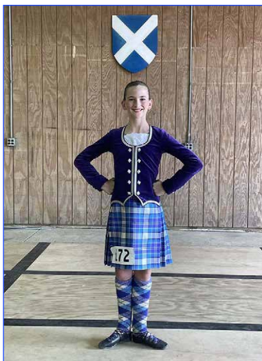
At the Ohio Highland Games, USA