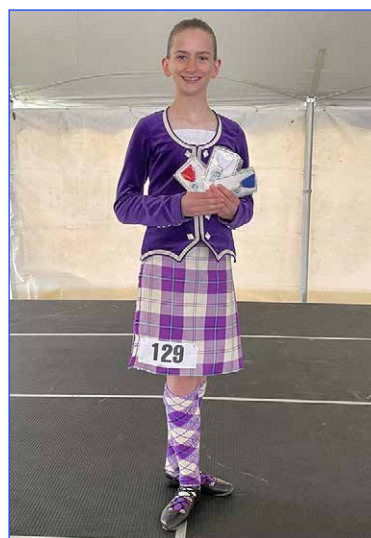
Loch Norman Highland Games in North Carolina, USA.

This summer I went to Scotland with my Grandma and Mum and I was able to attend two Highland Games. I competed at both.