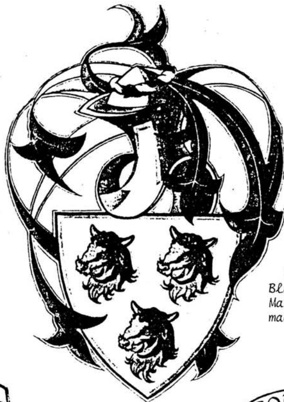
TURNBULL OF BADINRUELL (BEDRULE) Blazon taken from Pont's Manuscript, a collection of arms made by James Pont, A.D. 1624