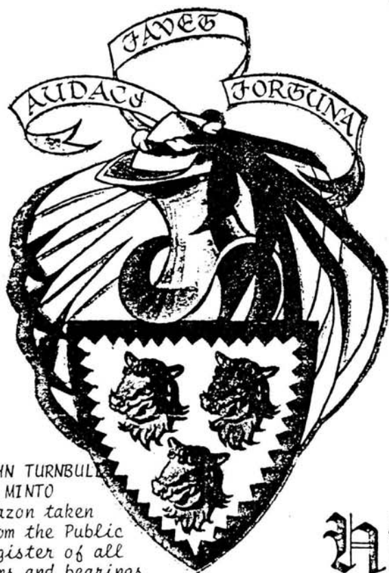
JOHN TURNBULL OF MINTO Blazon taken from the Public Register of all arms and bearings in Scotland, Vol. 1, p. 431, circa 1767