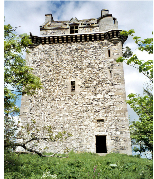
Fatlips Castle atop Minto Crags in the Borders, Scotland