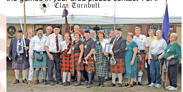
Turnbells gather at the games TCA clan tent

TCA sponsors clan tents at several popular Highland games so that members may have a chance to meet TCA representatives and build friendly relationships with others to whom they are "related" though the Turnbull Clan. If you are interested in hosting or helping the host of a tent at the games in your area please contact TCA.